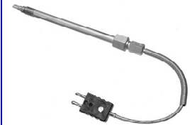
Twist Melt Bolt