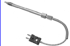
Twist Melt Bolt