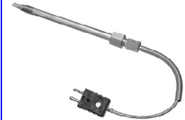
Twist Melt Bolt